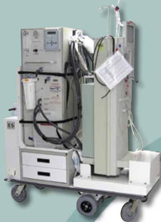
One-Piece Motorized Dialysis Workstation