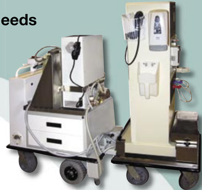
Two-Piece Motorized Dialysis Workstation