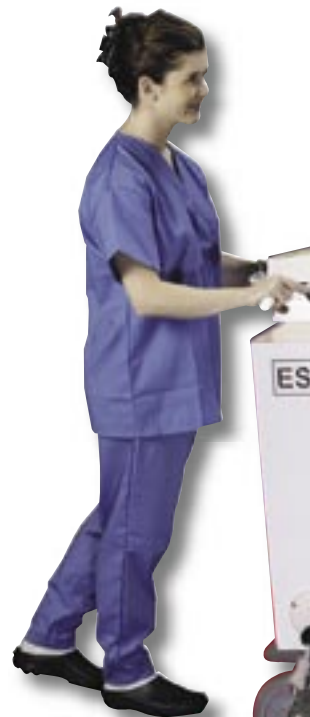
Motorized Dialysis Workstations